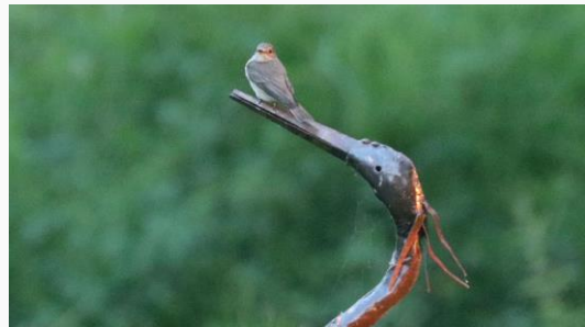
The splendid flycatcher looking for dinner